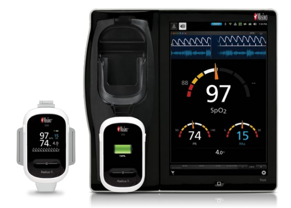
Radius-7® Wearable Patient Monitor