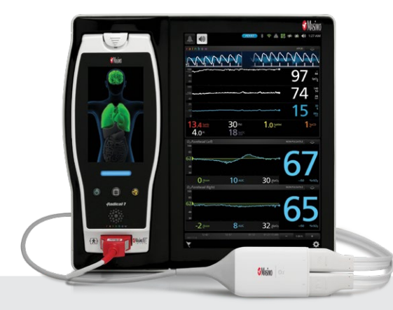
Root with O3® Regional Oximetry uses near-infrared spectroscopy (NIRS) to enable monitoring of tissue oxygen saturation (rSO2) in the brain