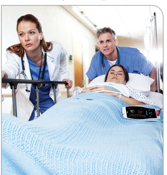
* Masimo SET® Measure-through Motion technology includes SpO2 and PR.