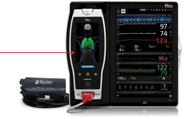
Radical-7® Handheld Monitor