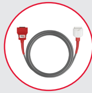
rainbow® RC-1 EMS Patient Cable > PN 4480